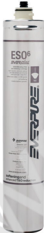
ESO 6 Replacement Cartridge: EV9607-10

Unique three stage blending cartridge provides softened/buffered/filtered water